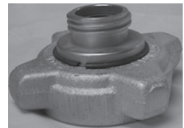
A5776 Reducer Coupling