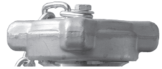
3194-90 Brass Cap