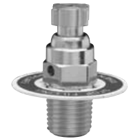
3165C with 2550-40P